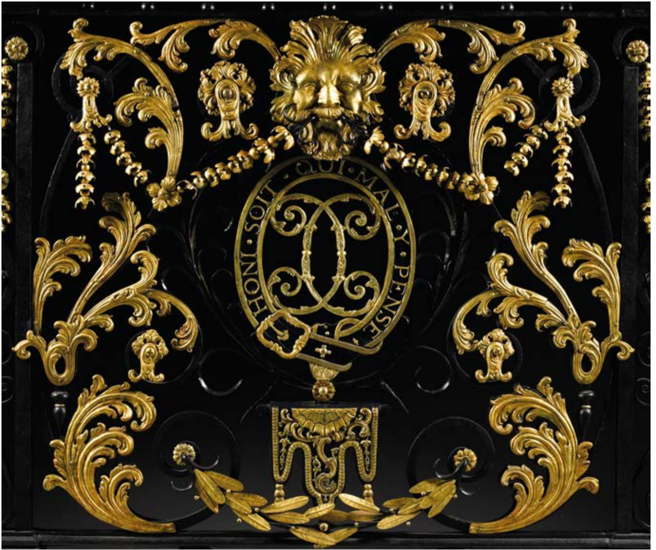
Plate 14 and detail English gilt bronze, painted and cast iron railings

The attribution of the railings to Jean Montigny was based on their obvious quality and the fact that Montigny worked for the Duke of Chandos at Cannons. Unfortunately, however, it was impossible to prove this attribution. The set of six railings had been significantly restored and adapted, and as the Devonshire House gates were a better example of Montigny's work (and could be firmly attributed to him), they did not believe that these were outstanding examples for the study of early 18th-century ironwork or Montigny's oeuvre.