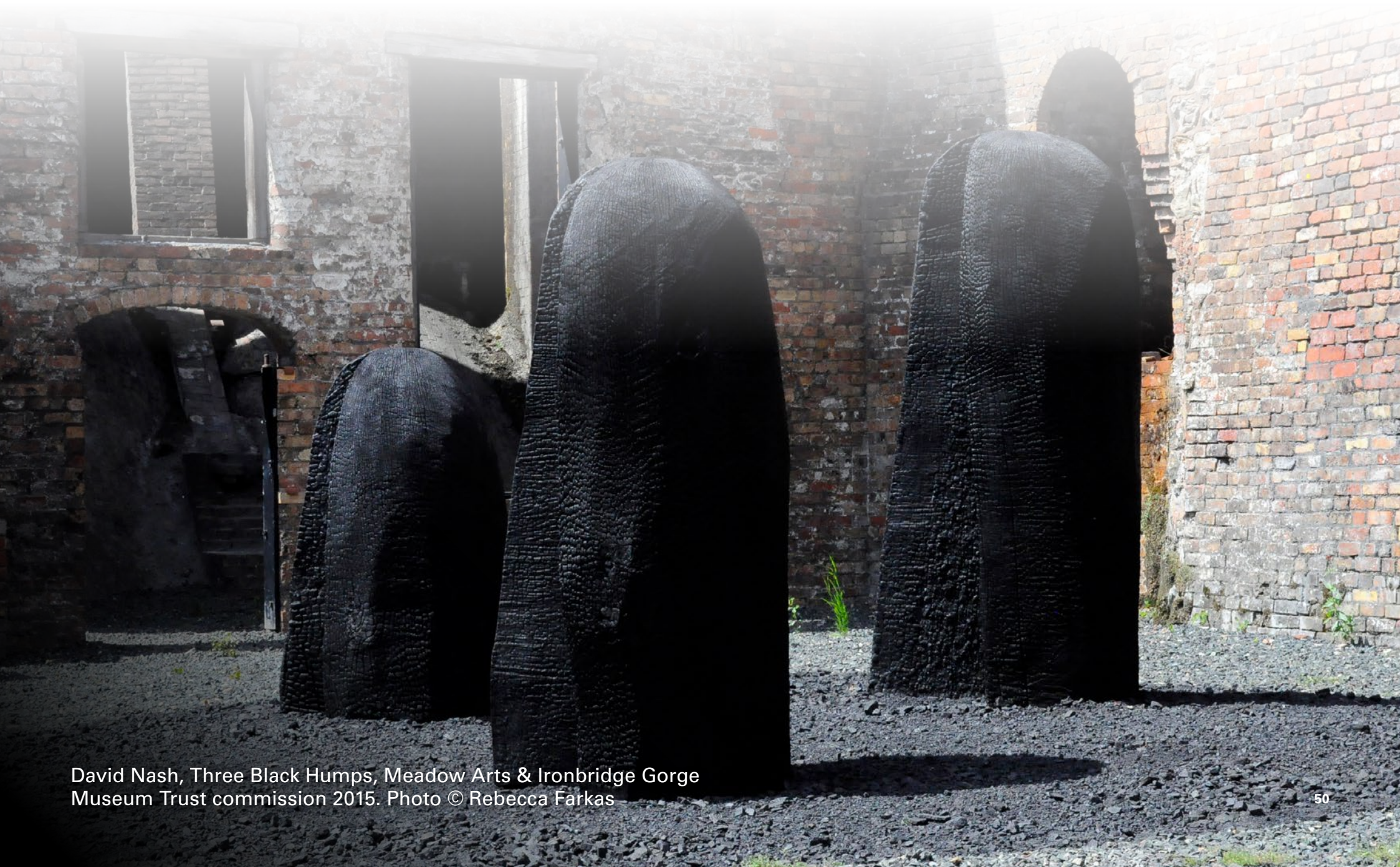
David Nash, Three Black Humps, Meadow Arts & Ironbridge Gorge Museum Trust commission 2015.