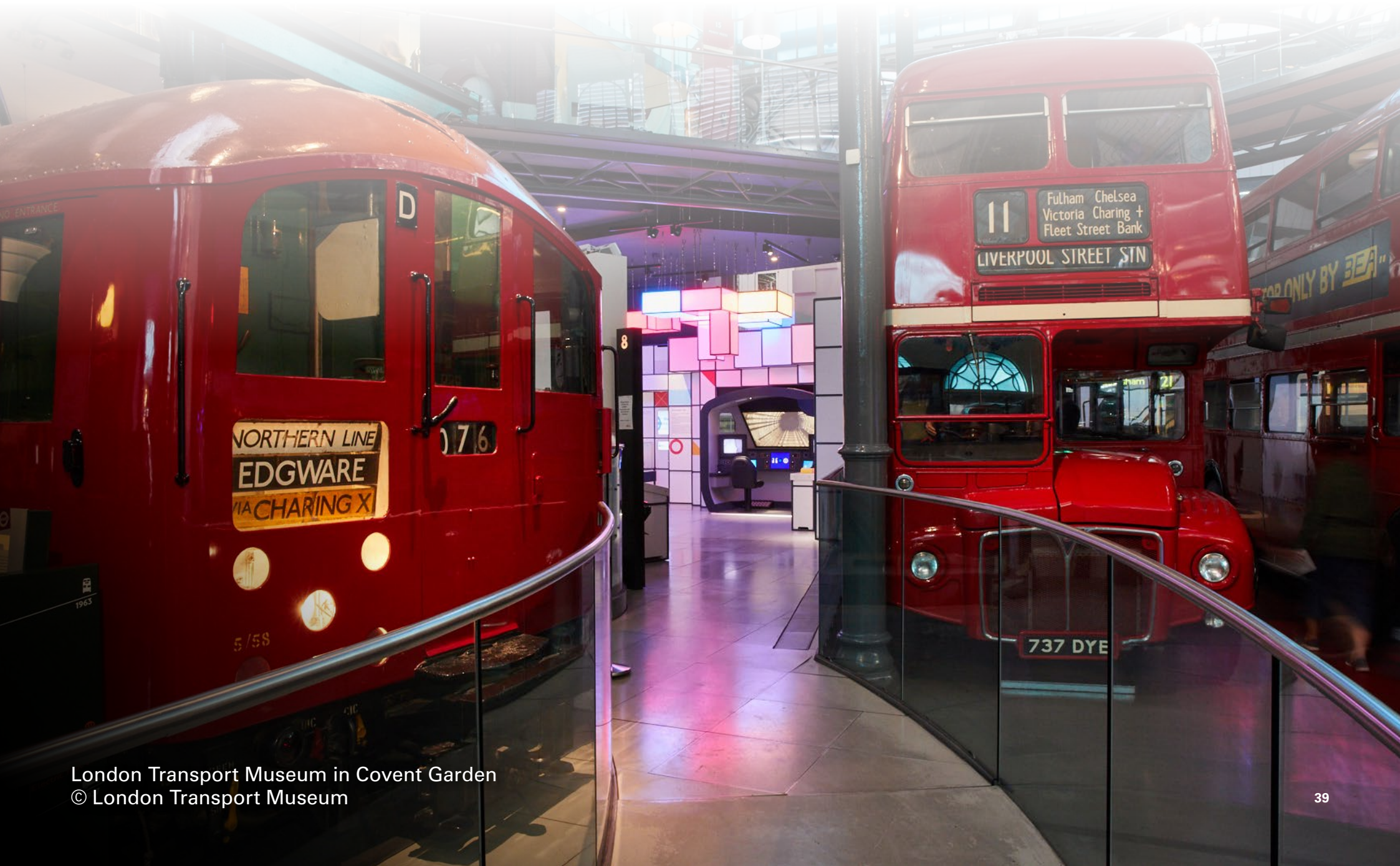
London Transport Museum in Covent Garden