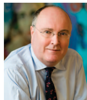
Alan Davey, Chief Executive, Arts Council England.

Public libraries are at a pivotal point. They are much loved and expected to continue offering the same services as they have for many years, but they are also expected to respond to big changes in how people live their lives.