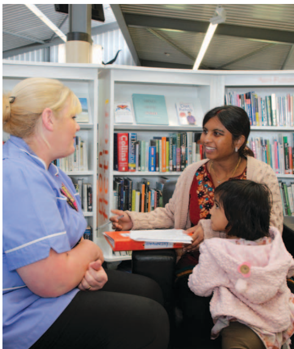
A healthcare consultation at Hamworthy Library, Dorset.