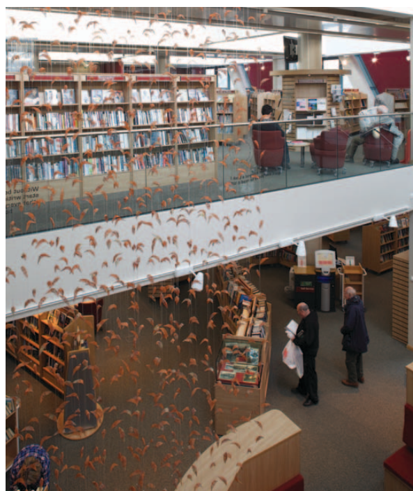
Paignton Library, Torbay.

So, it is time to re-assert the value, role and purpose of public libraries and point to how they can respond to change in order to remain at the heart of the community.