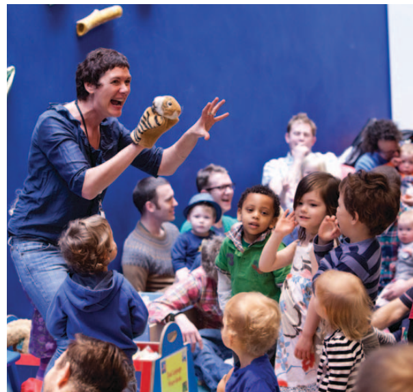
Storytime at Jubilee Library, Brighton.