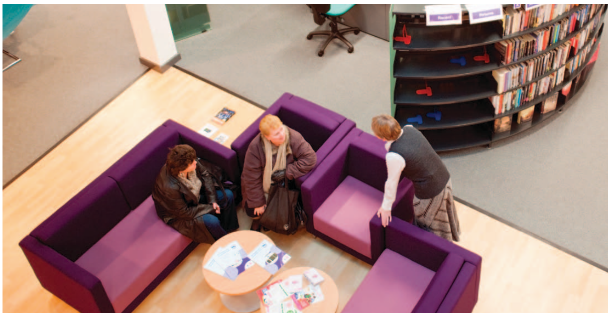
Pendleton Library, one of a number of public services co-located in Pendleton Gateway, Salford.

The Arts Council has a big role in developing public libraries in England but we cannot and should not attempt this alone. We want to inspire a collaboration that will allow the public library service to change and develop with confidence, delivering national leadership while respecting local accountability and flexibility.