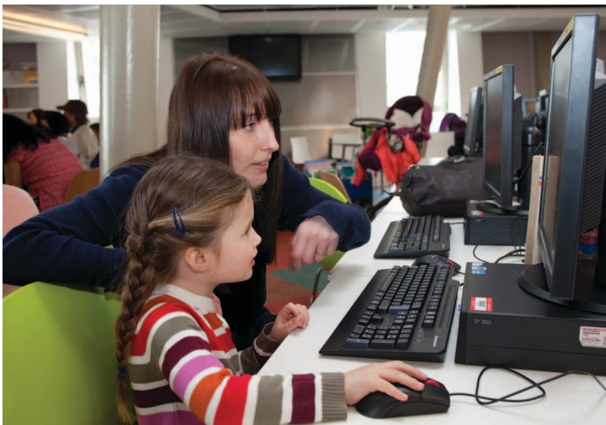
Making use of the digital resources at Canada Water Library, London.

The key issues emerging in this research are similar to those we handle with the wider arts and cultural sector. It is because there is such a close fit with the Arts Council's five long term goals that we will be able to develop solutions to these challenges from which both libraries and arts organisations can benefit.