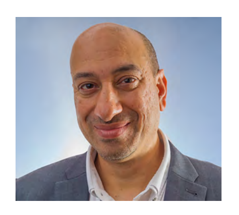
66 What do you need to join an Area Council? Curiosity, open-mindedness, enthusiasm and the ability to make informed decisions.